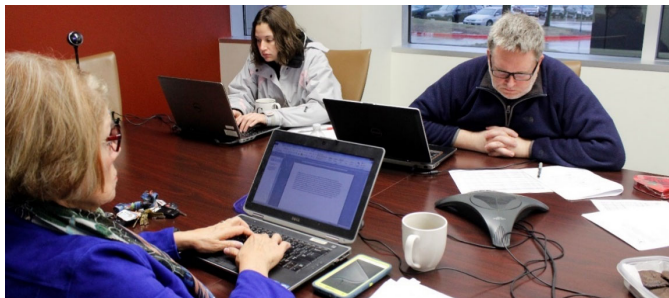
Conference call web meeting